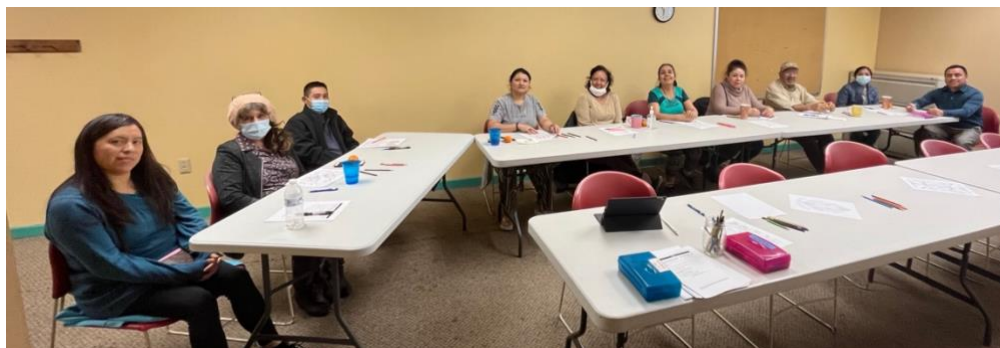
RPM community people attending a workshop on grief and loss

We come alongside families committed to breaking the cycle of poverty and illiteracy so they, their children, and grandchildren are better equipped to give back and help others.