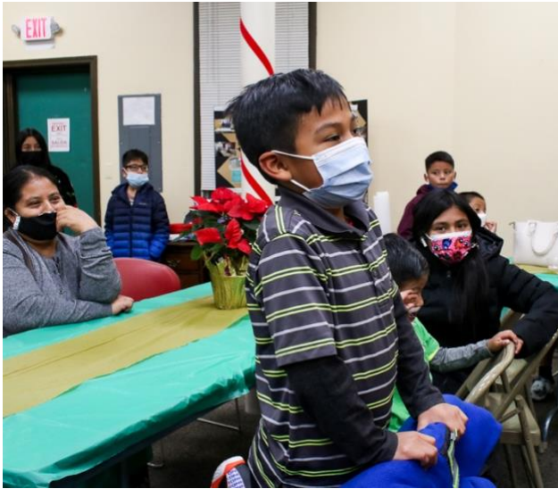
A neighborhood boy eagerly awaits presents for his family.