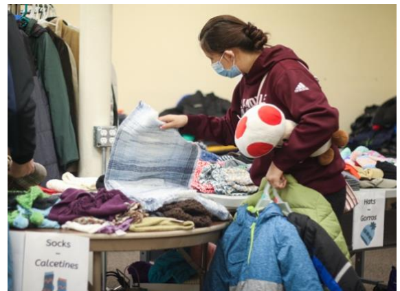
Thanks to our generous donors, we gave away nearly 700 warm winter coats, plus socks, scarves, hats, and gloves to neighborhood families during last year’s coat drive.